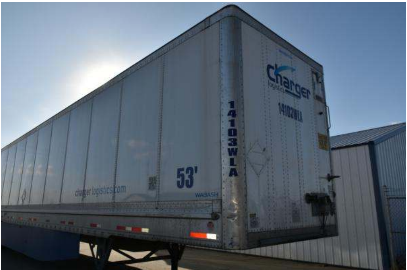
RT FRONT CORNER DAMAGE