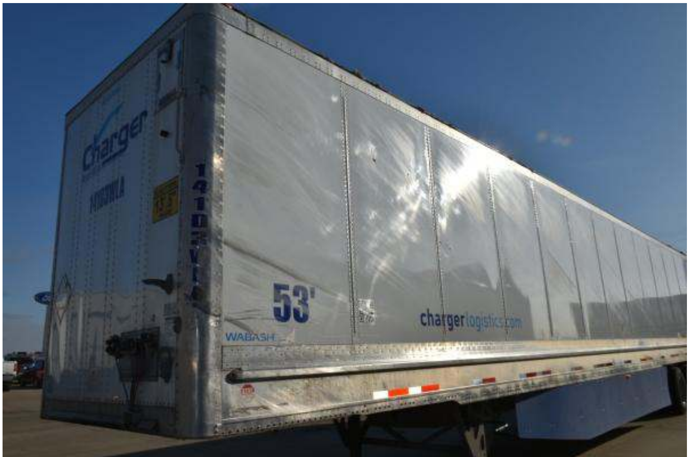
LF FRONT SIDE DAMAGE