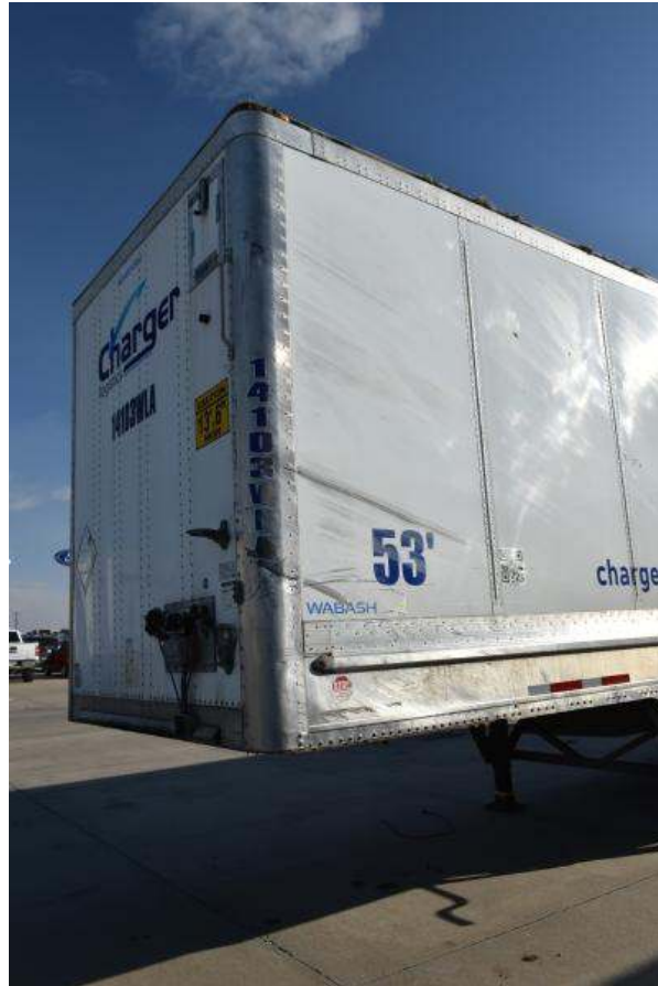
LF FRONT CORNER DAMAGE