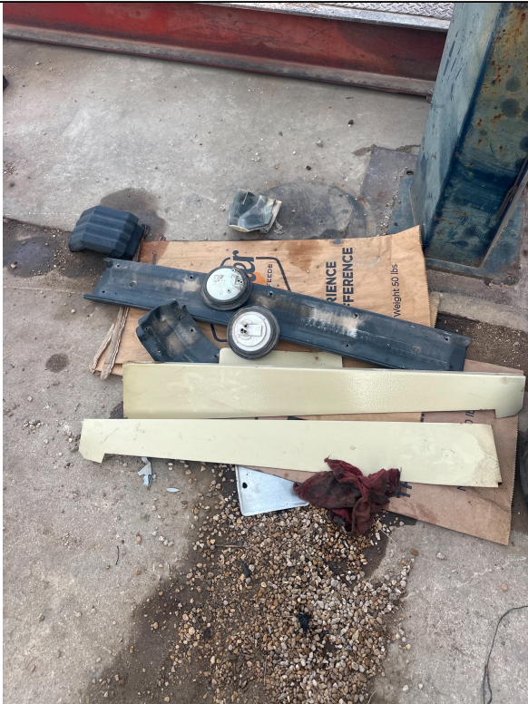
Photo: 29 Date Taken: 01/22/2026 Description: Damaged parts