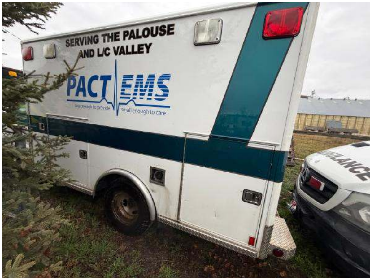
LT SIDE 1