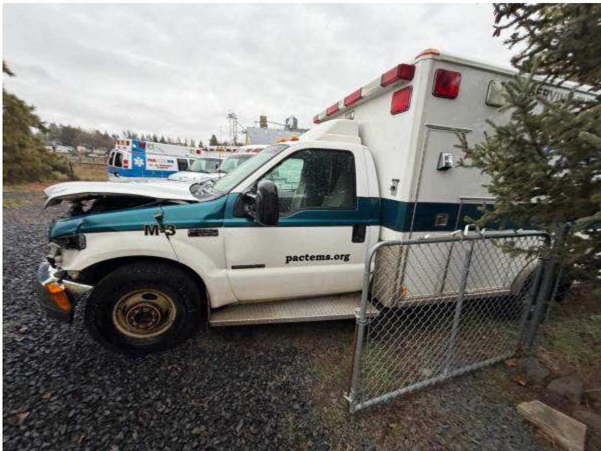
LT SIDE 2