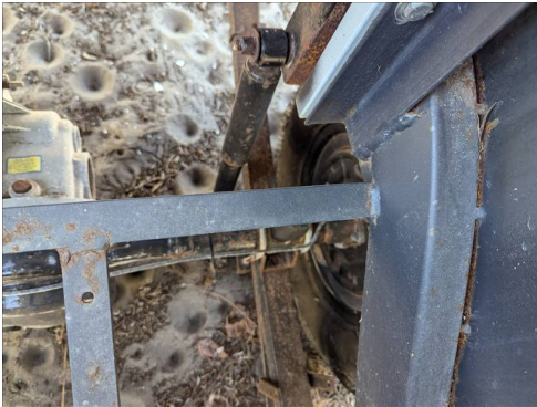
6/2/2025 E01 Comments: