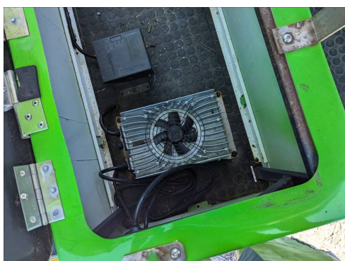
6/2/2025 E01 Comments: