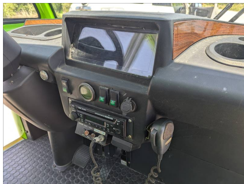
6/2/2025 E01 Comments: