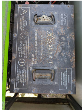
6/2/2025 E01 Comments: