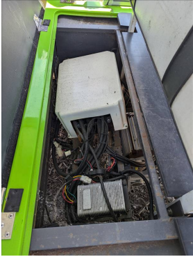
6/2/2025 E01 Comments: