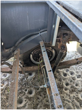
6/2/2025 E01 Comments: