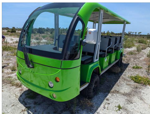
6/2/2025 E01 Comments: