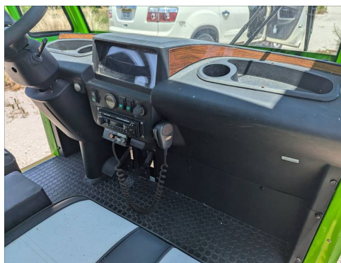
6/2/2025 E01 Comments: