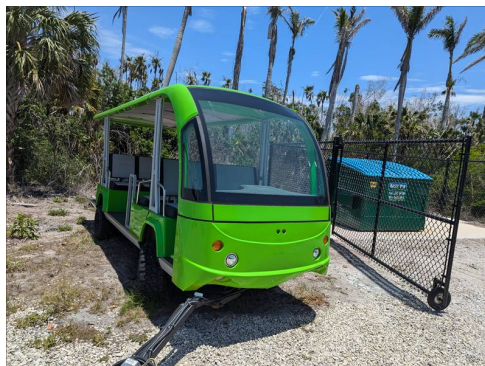
6/2/2025 E01 Comments: