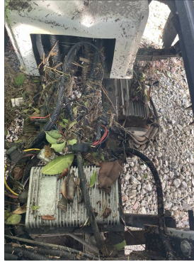
6/2/2025 E01 Comments: