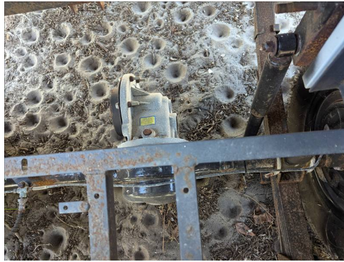
6/2/2025 E01 Comments: