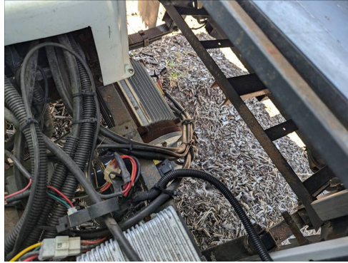
6/2/2025 E01 Comments: