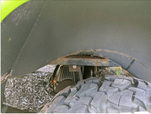
6/2/2025 E01 Comments: