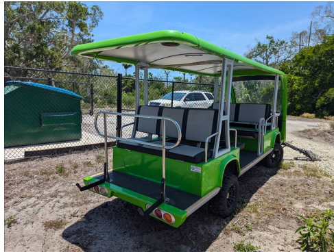
6/2/2025 E01 Comments: