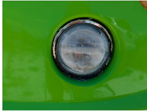
6/2/2025 E01 Comments: