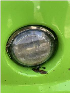
6/2/2025 E01 Comments: