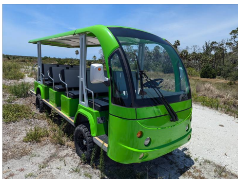
6/2/2025 E01 Comments: