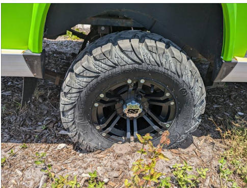
6/2/2025 E01 Comments: