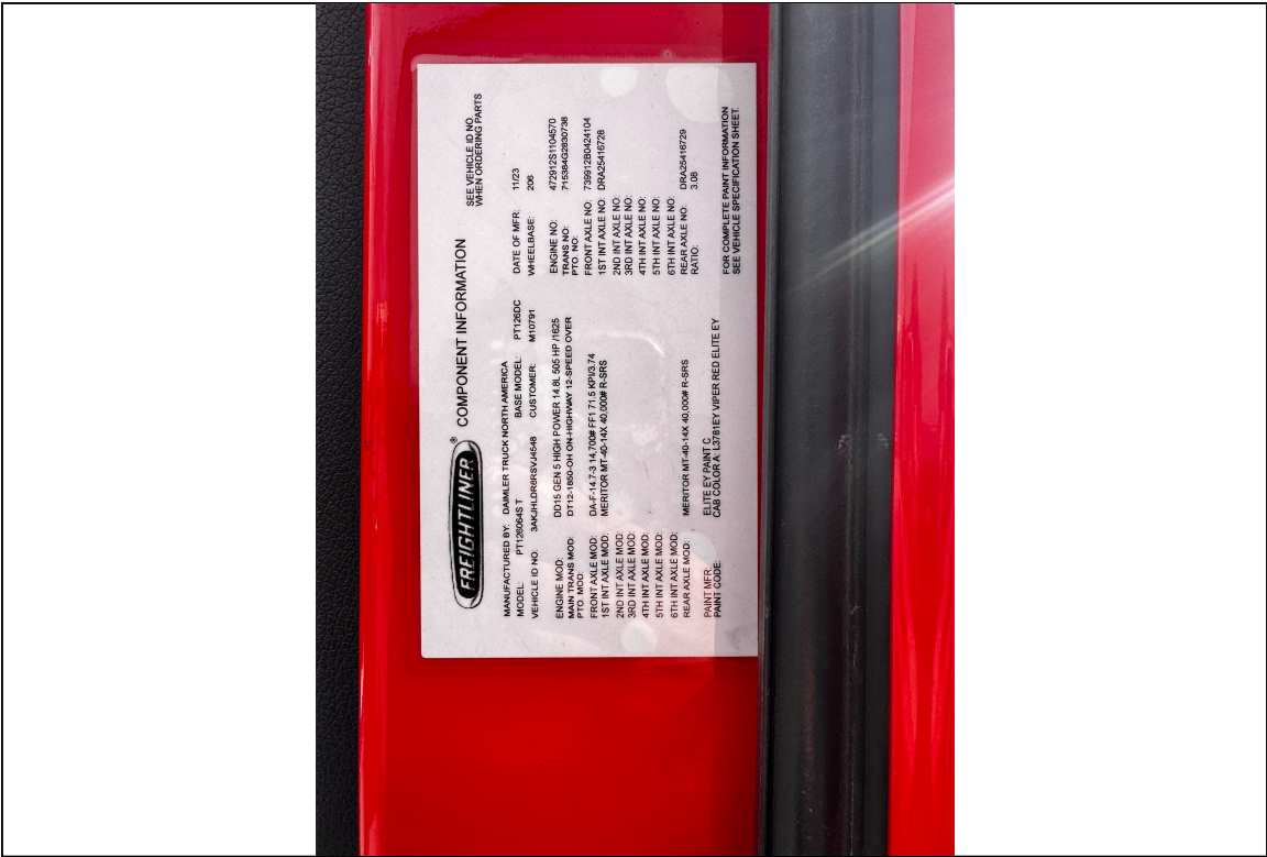
Photo: 2 Date Taken: 12/19/2025 Taken By: Josefina Cruz Description: manufacture information

Photo: 1 Date Taken: 12/19/2025 Taken By: Josefina Cruz Description: VIN: 3AKJHLD8RSVJ 4548