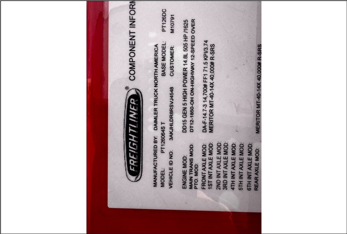
Photo: 1 Date Taken: 12/19/2025 Description: VIN: 3AKJHLD8RSVJ 4548