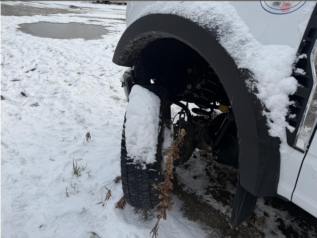
Photo: 9 Date Taken: 12/03/2025 Description: Left front tire damage