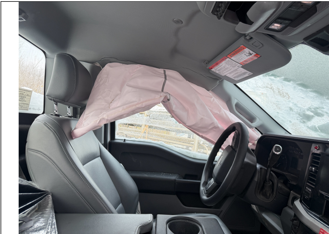
Photo: 28 Date Taken: 12/03/2025 Taken By: Jeremy Garcia- Baez Description: Drivers side airbag

Photo: 27 Date Taken: 12/03/2025 Taken By: Jeremy Garcia- Baez Description: Right passenger seat airbag