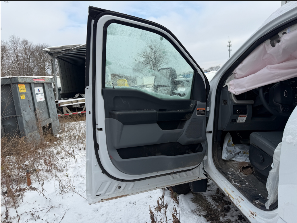
Photo: 29 Date Taken: 12/03/2025 Description: Drivers door trim