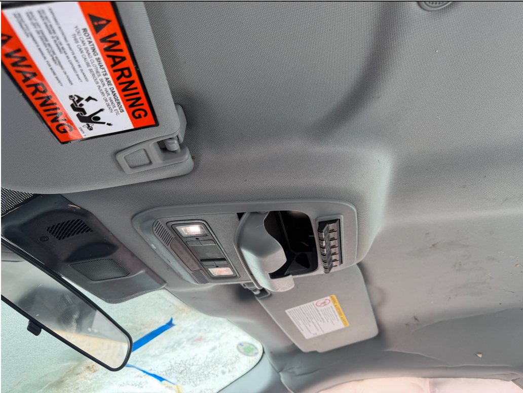
Photo: 33 Date Taken: 12/03/2025 Description: Headliner