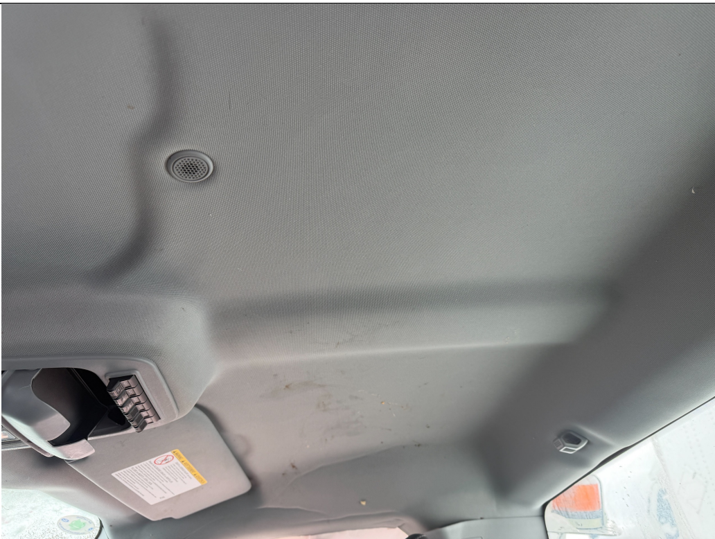
Photo: 34 Date Taken: 12/03/2025 Taken By: Jeremy Garcia- Baez Description: roof

Photo: 33 Date Taken: 12/03/2025 Taken By: Jeremy Garcia- Baez Description: Headliner