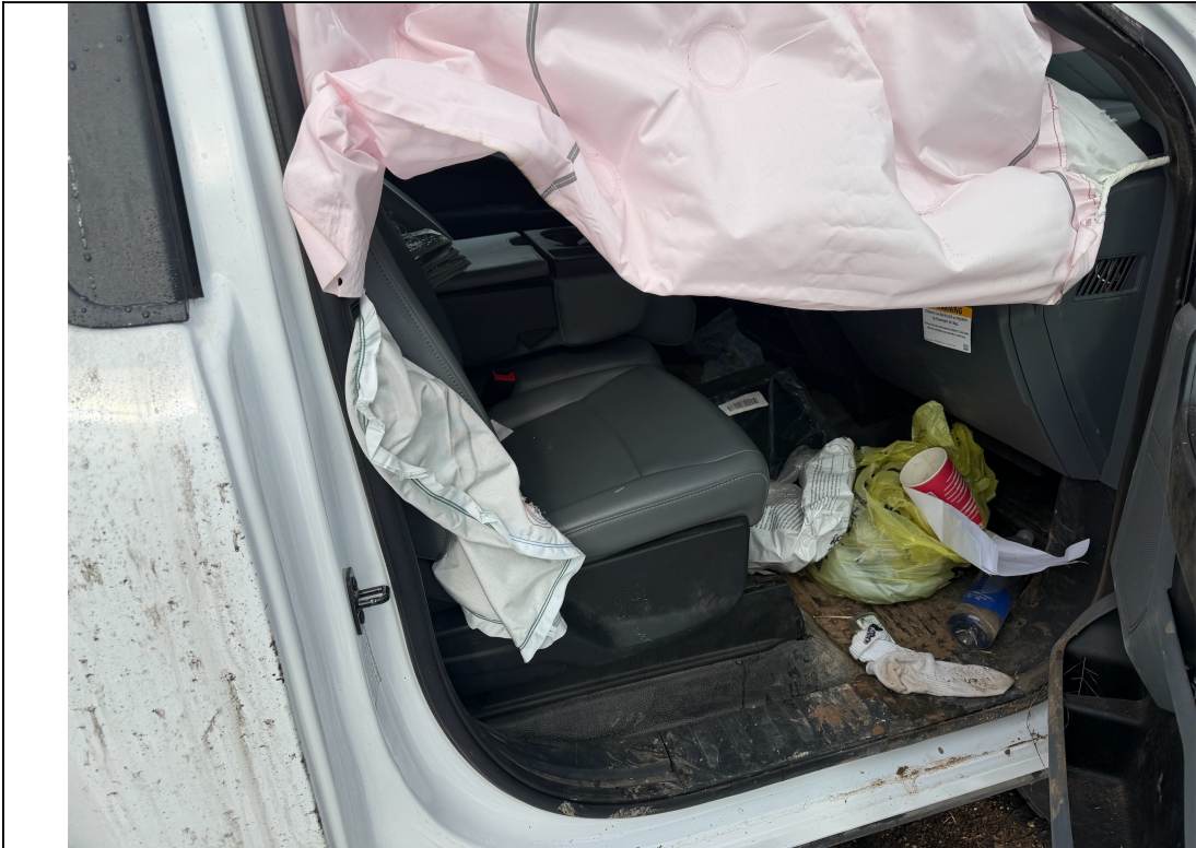
Photo: 27 Date Taken: 12/03/2025 Description: Right passenger seat airbag