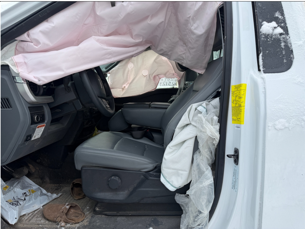
Photo: 30 Date Taken: 12/03/2025 Taken By: Jeremy Garcia- Baez Description: Drivers seat/airbag

Photo: 29 Date Taken: 12/03/2025 Taken By: Jeremy Garcia- Baez Description: Drivers door trim