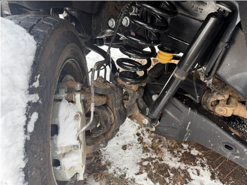
Photo: 10 Date Taken: 12/03/2025 Taken By: Jeremy Garcia- Baez Description: Left front axle dame

Photo: 9 Date Taken: 12/03/2025 Taken By: Jeremy Garcia- Baez Description: Left front tire damage