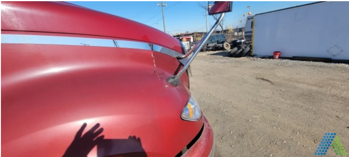
Document Name: S-4.jpg