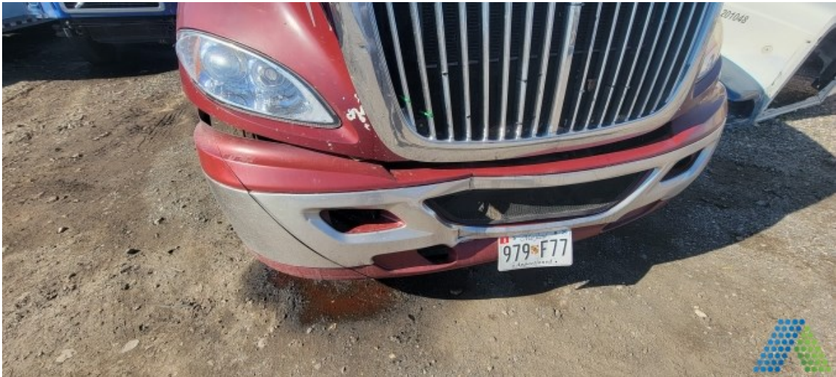
Document Name: S-5.jpg