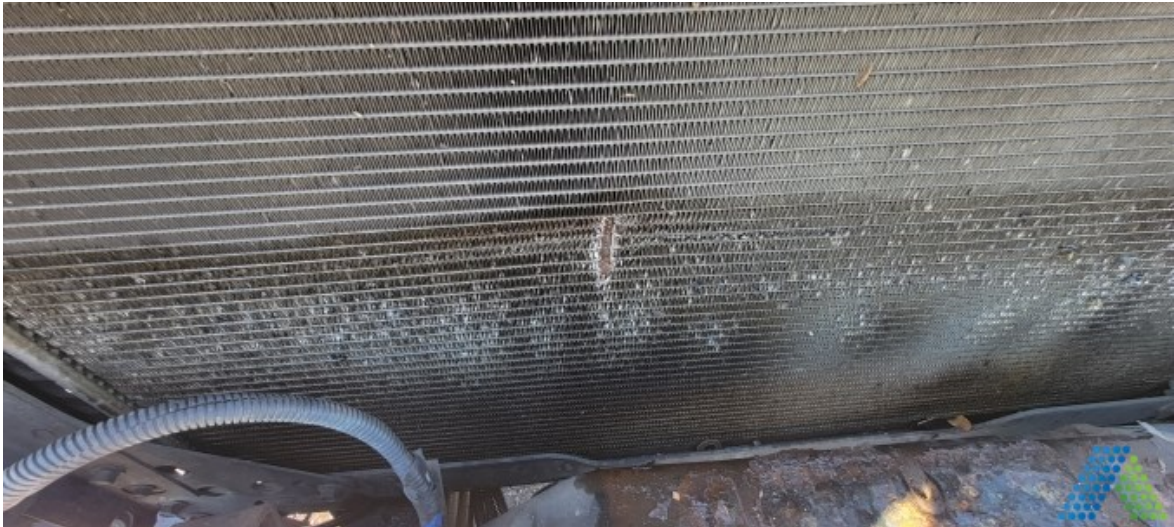
Document Name: S-6.jpg