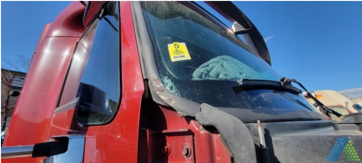
Document Name: S-3.jpg