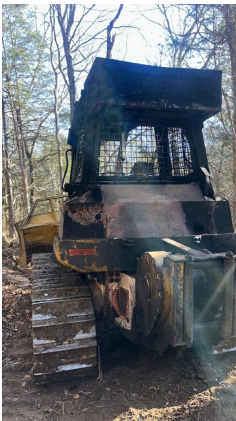
Photo of Rear