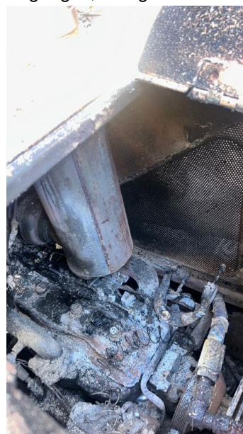
Engine is a completed burn