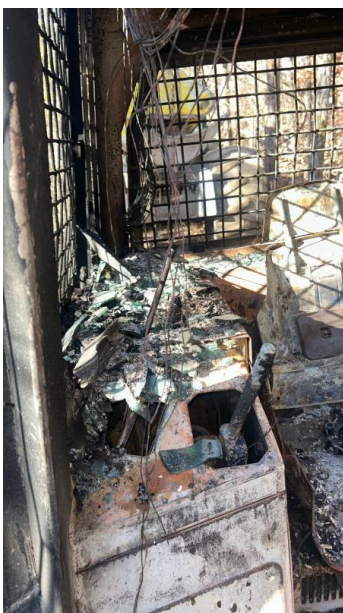
right side Operators controls are damaged