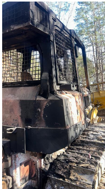
Damage can be seen down the right side of the machine's body.