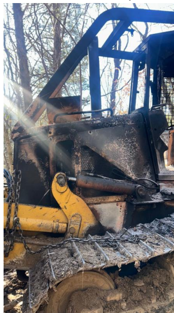
Body Panels, engine, and hydraulics are damaged.

Fire damage to the rear of the equipment is evident. Its possible the winch is unharmed and still operational.