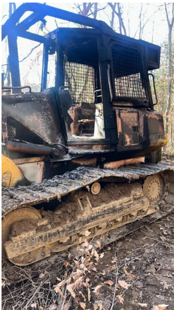
Over all view of the damage.