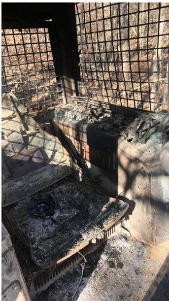
Left Side operators controls are damaged.