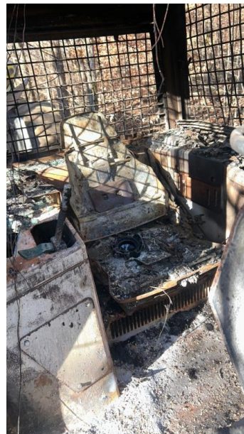
Operators Cabin is a complete burn. all controls, seating, gauges, and glass was destroyed.