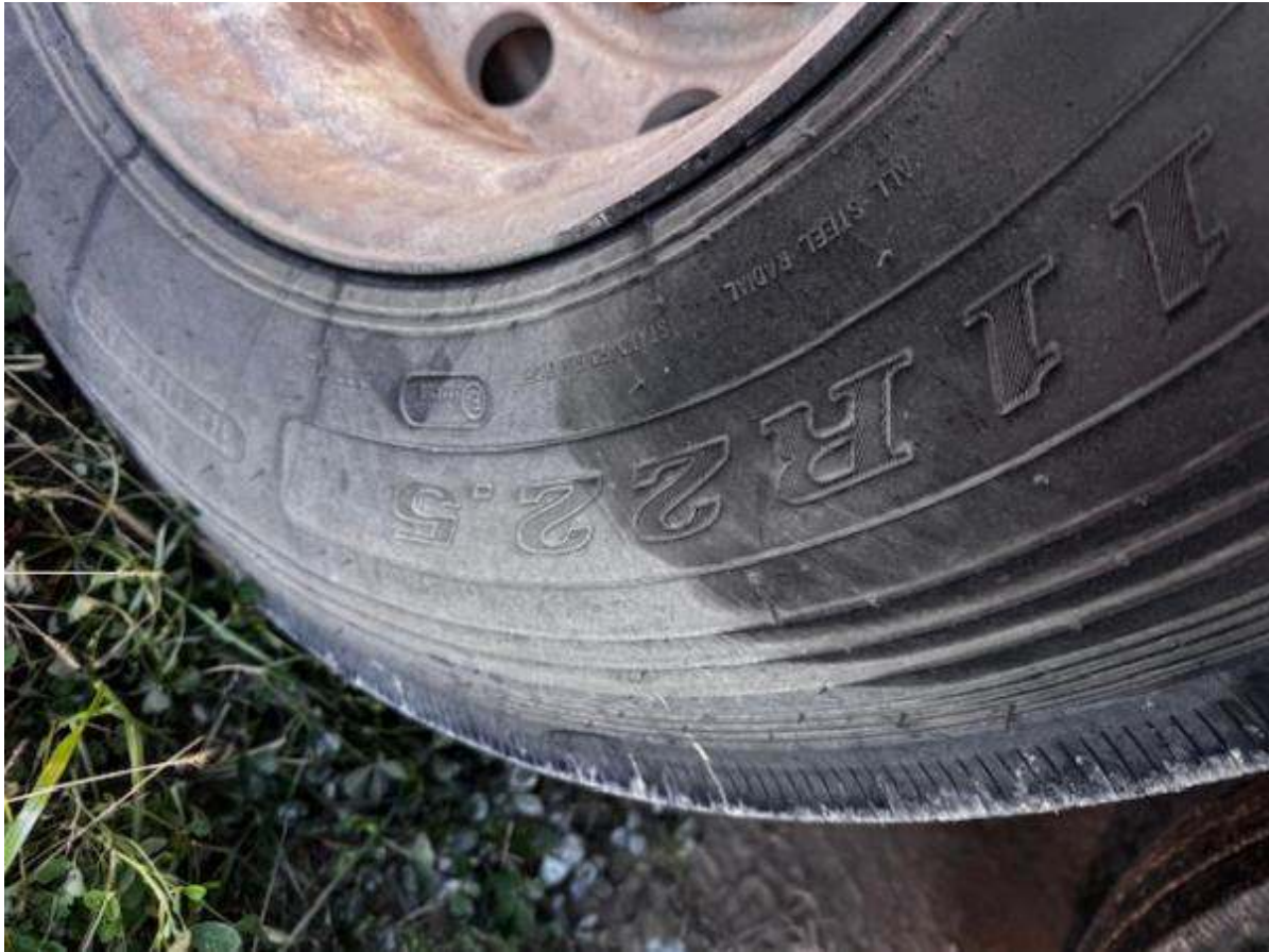
Tire / 11R22.5