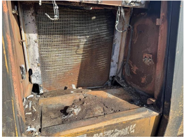
rear of the machine where the radiator, charge air cooler, and oil coolers are housed. all damaged.