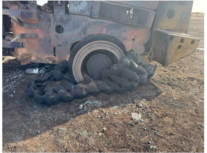
Left rear tire, completely damaged