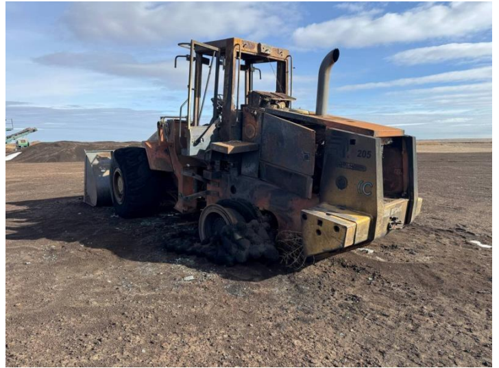
Photo of Rear Left