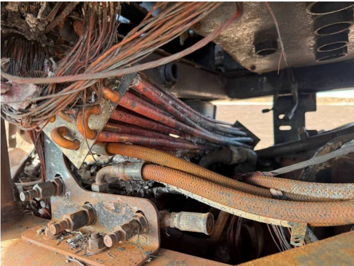
Hydraulic lines and coolers are all damaged.