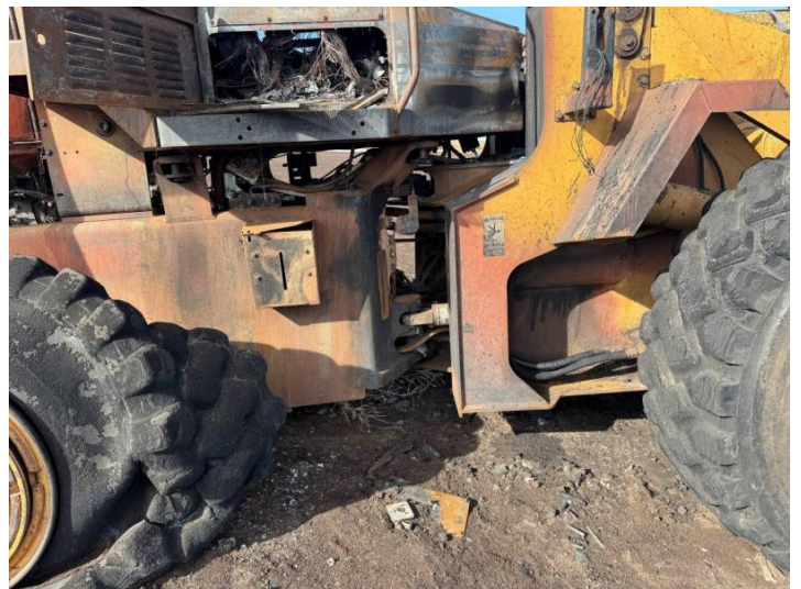
area where the equipment articulates. All bearings, joints and seals have been damaged