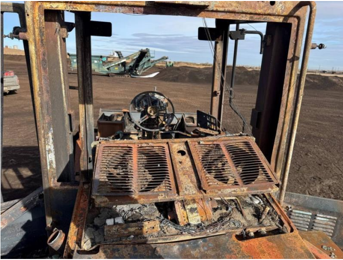
Area behind cab. Part of the cooling system, all damaged