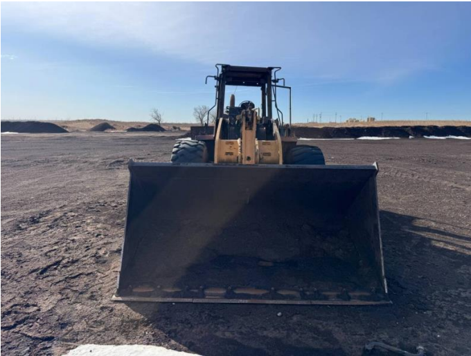
Photo of Front

VIN: JEE0093339 Style: Wheel Loader Plate/State: - WMI: FIN: Odometer: Color: Date Of Loss: 12/16/2025 Authorized By: Claim Number: 0AB484307 RO: