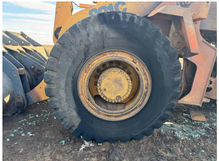
Left front tire, damaged by fire