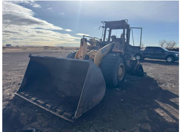
Photo of Front Left