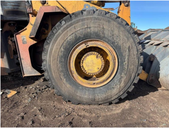
Right front Tire, shows signs of heat damage