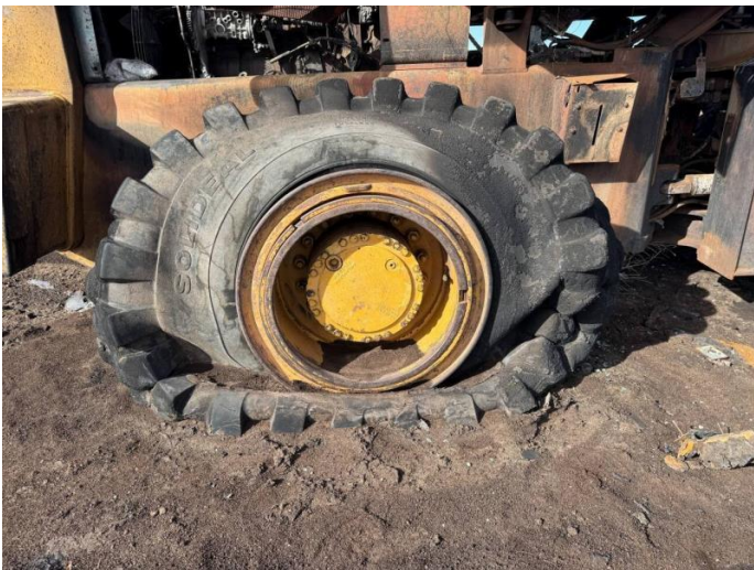
Right rear tire, completely damaged.