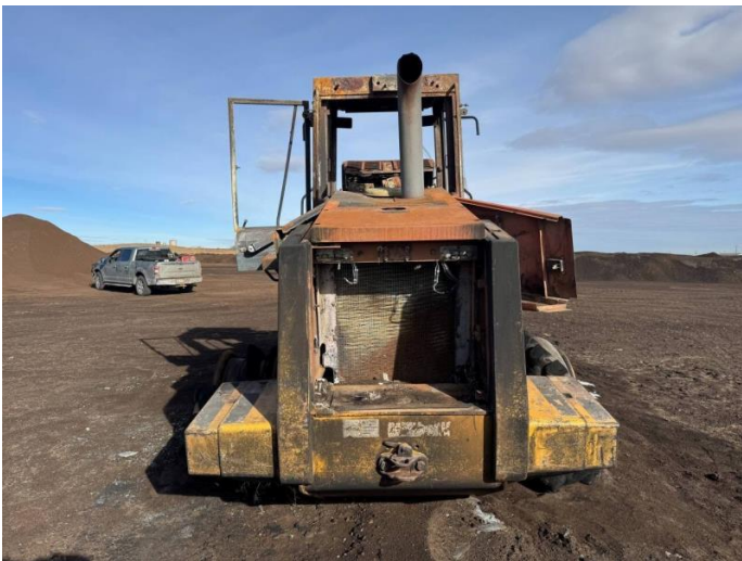
Photo of Rear