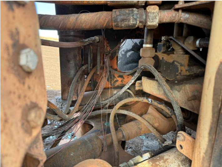
Hydraulics, transmission, and drive train have been subject to fire damage