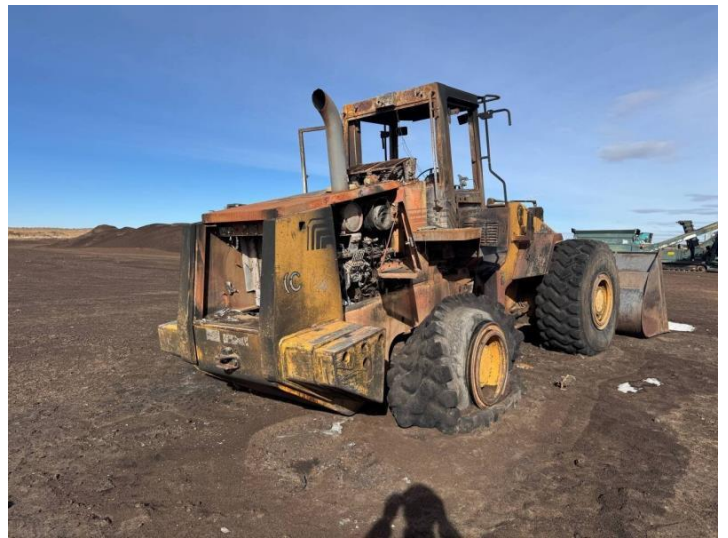
Photo of Rear Right