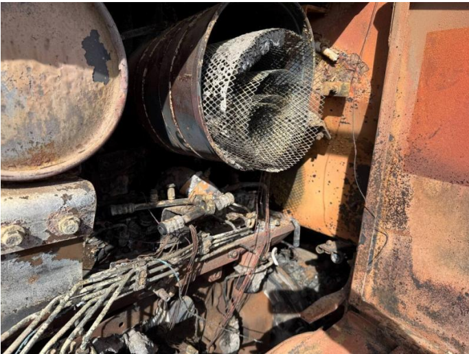
Air intake system, fuel lines, coolant lines, and wiring all damaged.