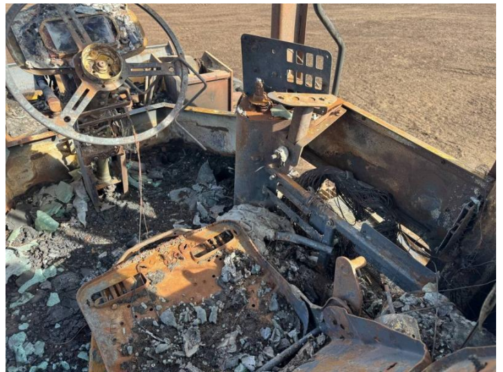
Operators station, Complete and total burn