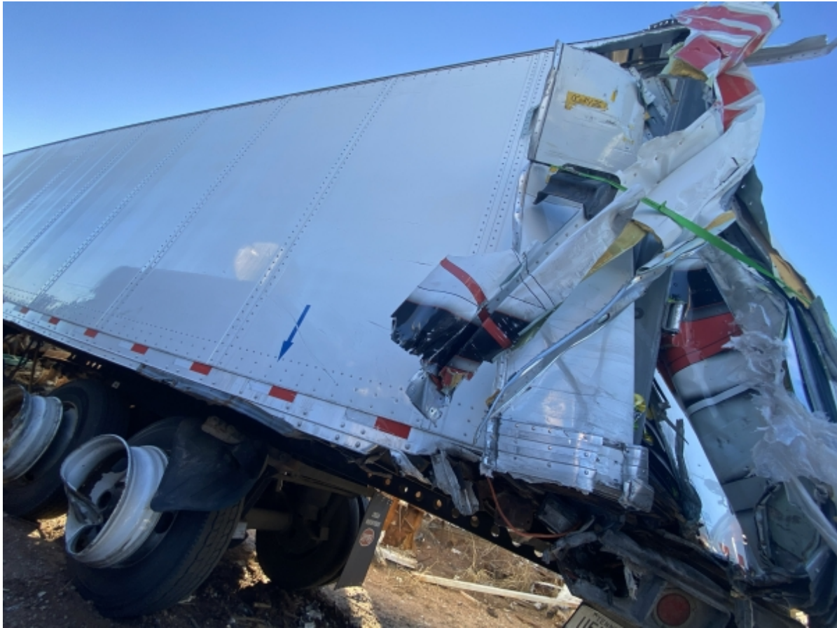
Left Rear, Impact area