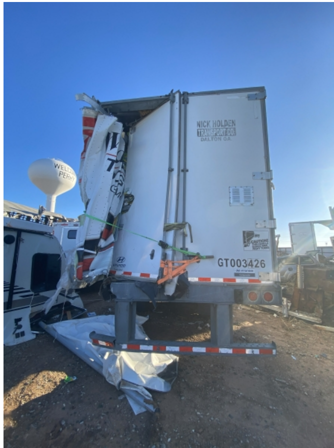
rear door damage