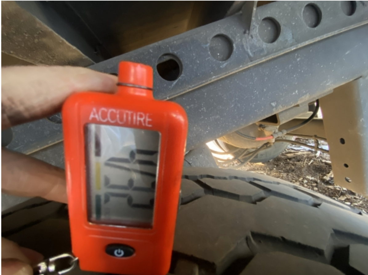
left inner front tire tread