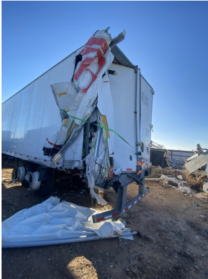
Left Rear, Impact area