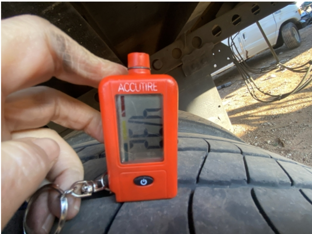
Right front inner tire tread