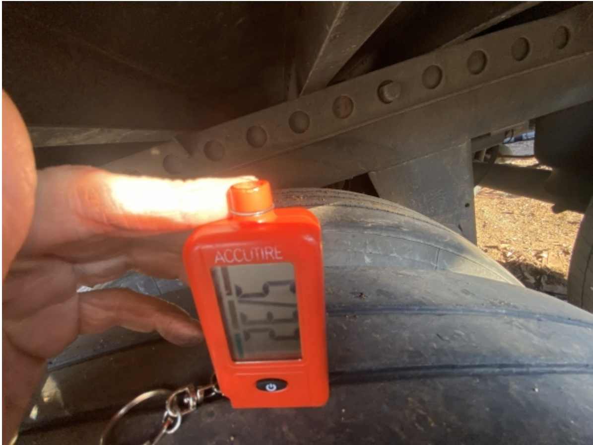
Right Rear inner tire tread