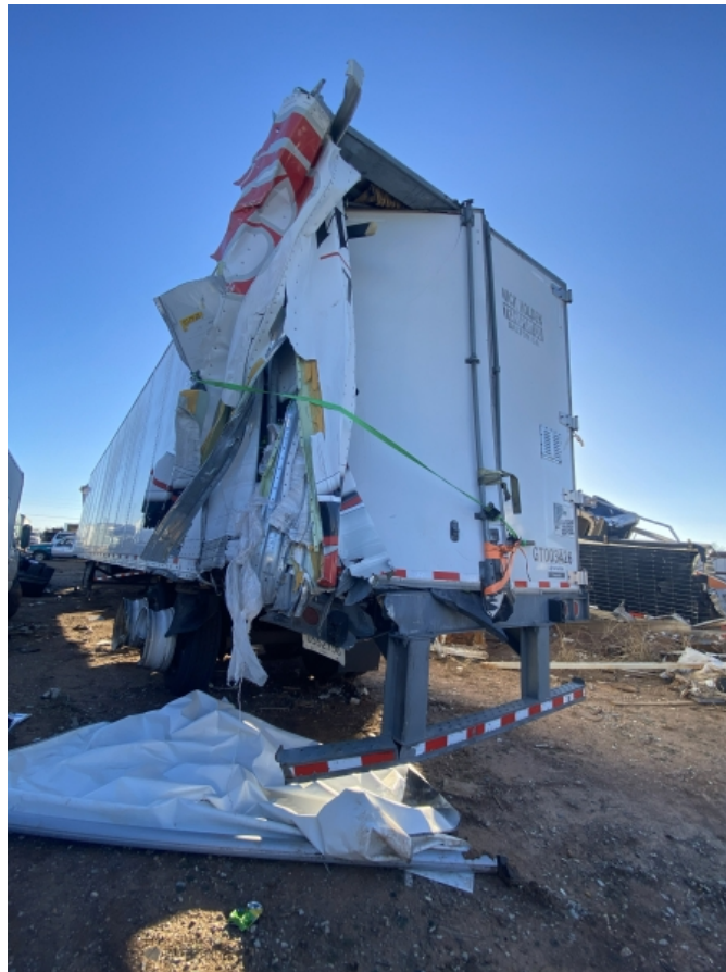
Left Rear, Impact area