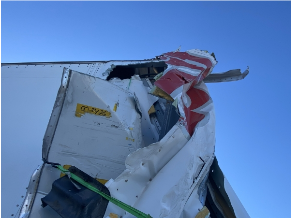
Left Rear, Impact area