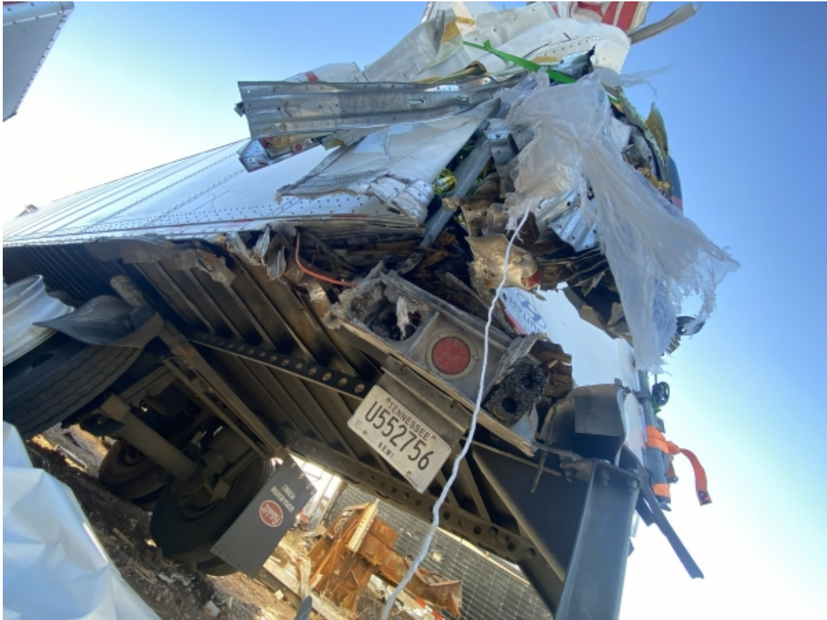
Left Rear, Impact area