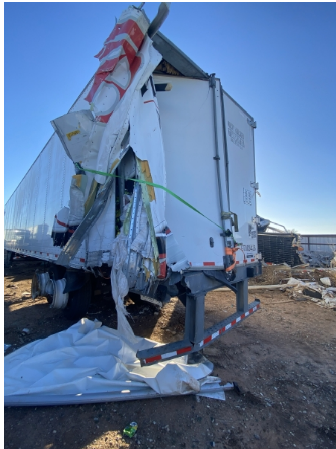
Left Rear, Impact area