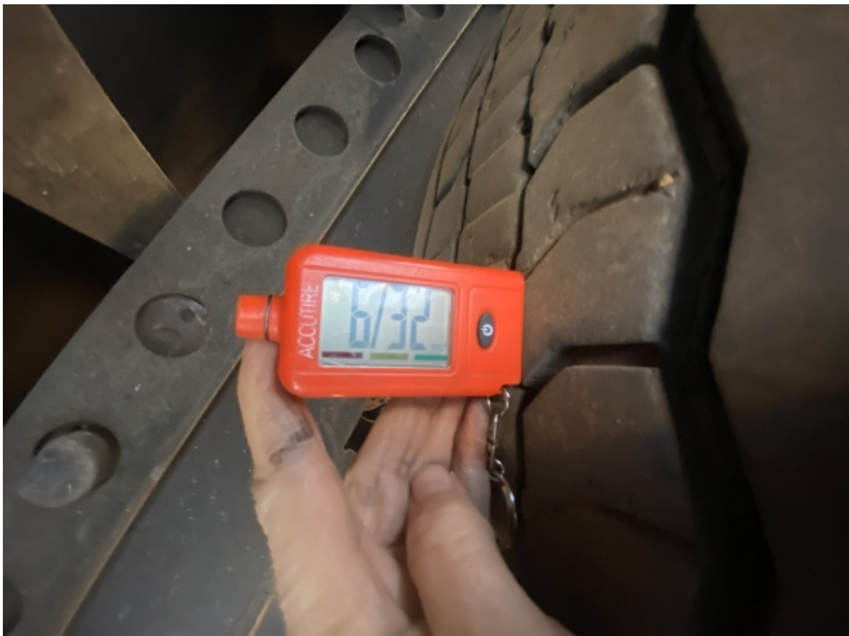
left inner rear tire tread