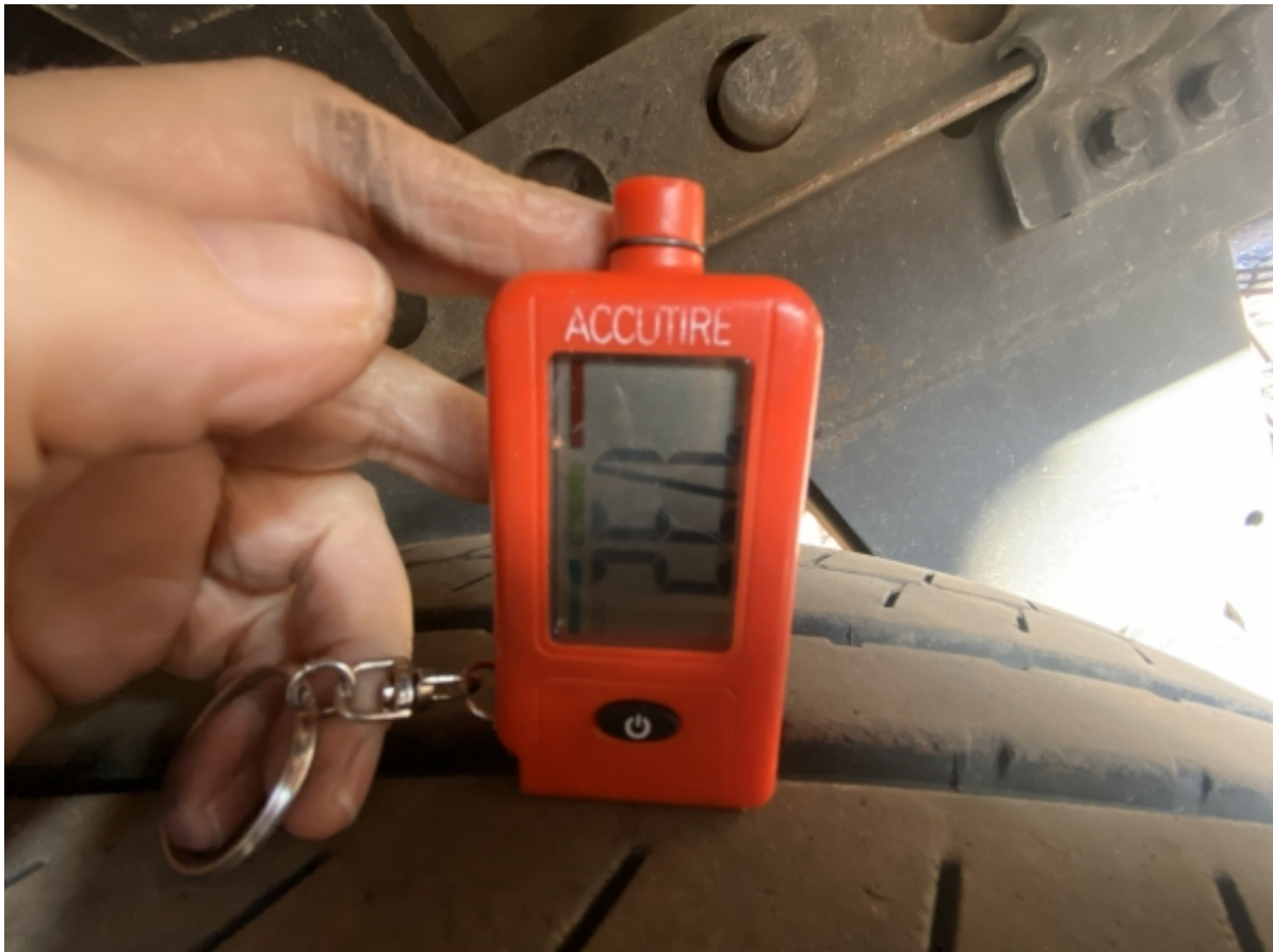
Right front outer tire tread