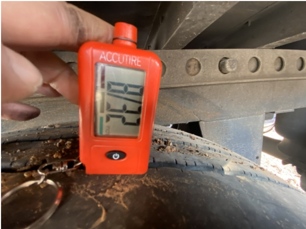
Right Rear outer tire tread